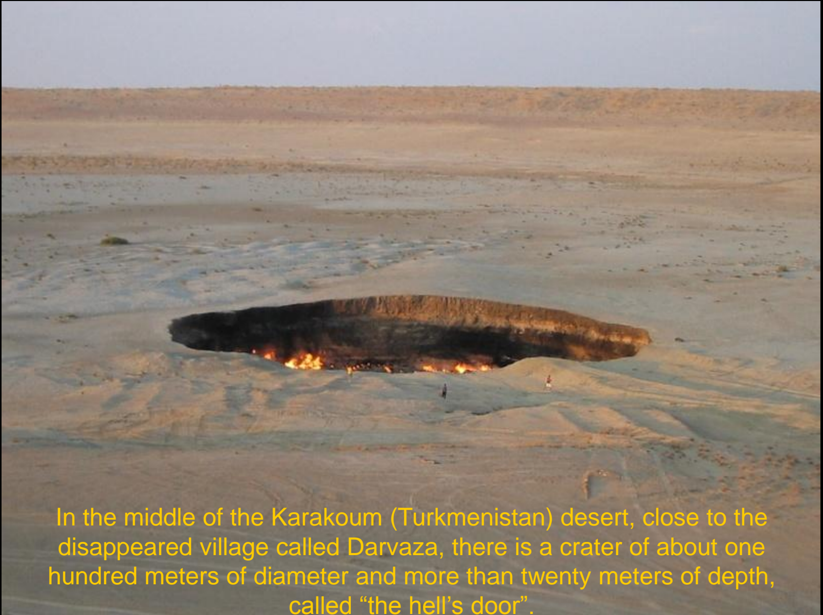
In the middle of the Karakoum (Turkmenistan) desert, close to the disappeared village called Darvaza, there is a crater of about one hundred meters of diameter and more than twenty meters of depth, called “the hell’s door”.